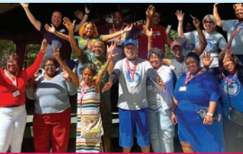
CHANGING LIVES FOREVER

goods and services distributed to unsheltered neighbors