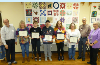
CHANGING LIVES FOREVER

goods and services distributed to unsheltered neighbors